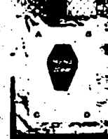
Pitching Net with Target $99.95

PACKAGE PRICE: All Three for Only $149.95