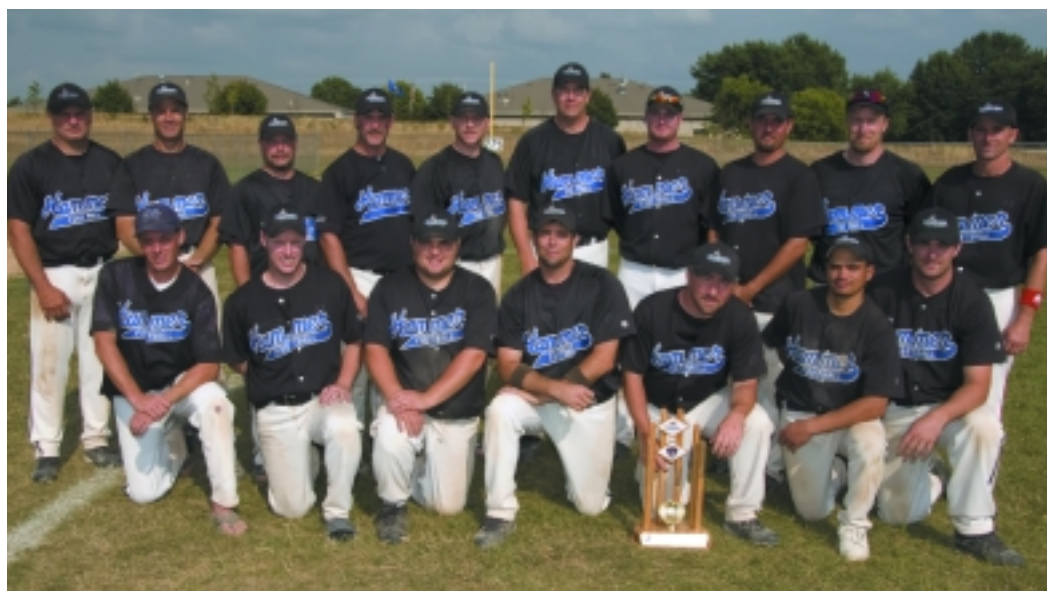
Waterdown Hammer Runnerup, 2008 ISC II Tournament of Champions