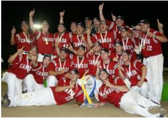
Canada celebrates their Pan American Men's Championship title.